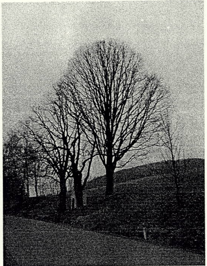
01.01.2000 1 Roßkastanie, 1 Eiche, GrSt 327/1, KG Heuberg, MGde Pyhra