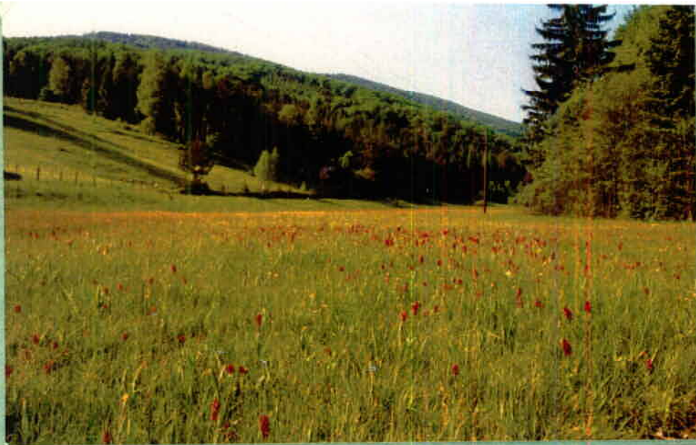
Knabenkraut ( Orchis dactyloides )