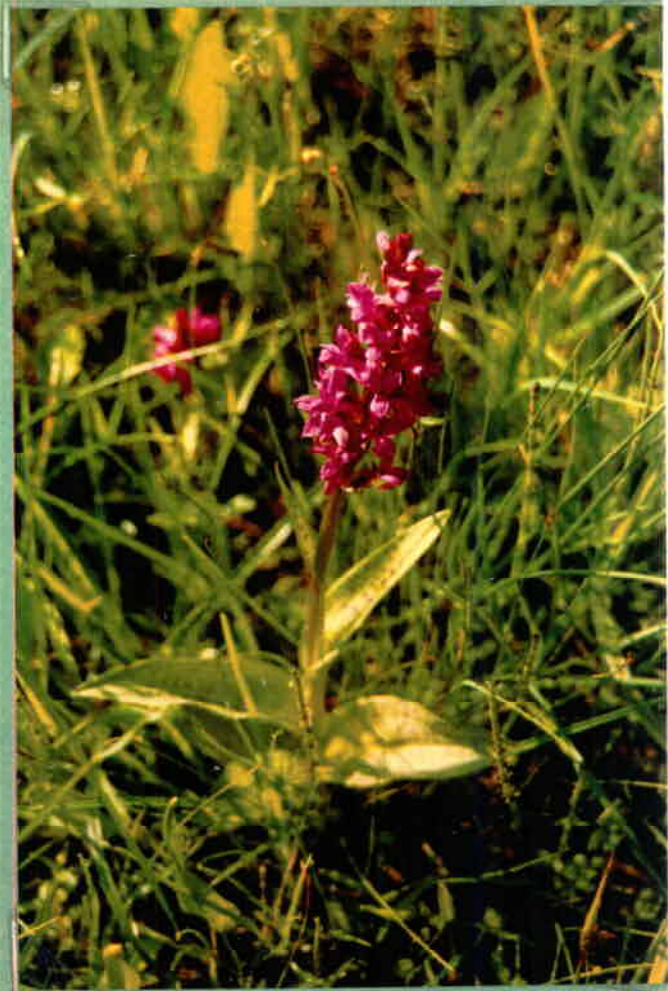
Knabenkraut ( Orchis dactylorrhiza )